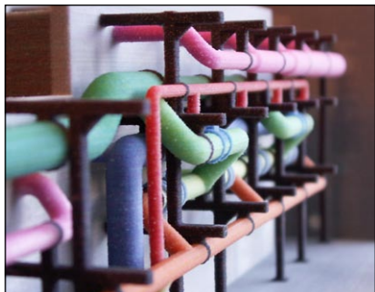
Model of a water plant renovation project in Kaliningrad, Russia