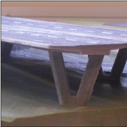
Model of a motorway overpass near Vejle, Denmark

“Architectural designers think in spatial terms, and a 3D model helps bridge the gap between them and the engineers charged with bringing the design to reality. With a physical model, the engineers can see the concept in concrete terms and can easily imagine themselves in the 3D space.”