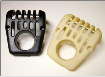
Muffler Guard with Concept Model Printed with ZPrinter 310 Plus