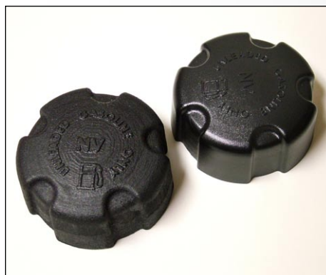
Fuel Tank Cap and Prototype Printed with ZPrinter 310 Plus

– ANDY JOHNSON INDUSTRIAL DESIGNER POWERMATE